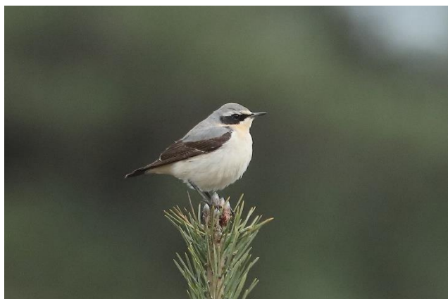
Wheatear: Wishmoor Bottom; 15Mar2023