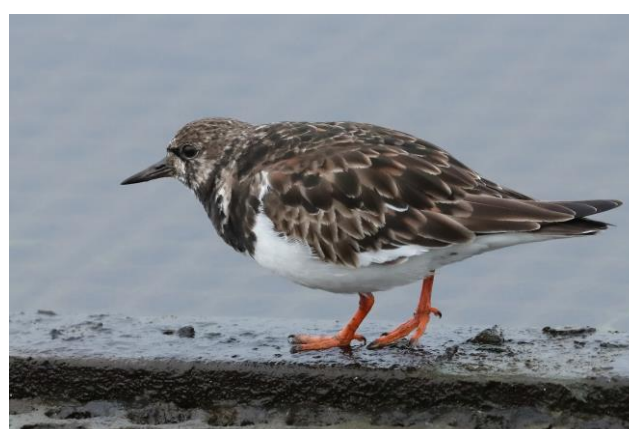
Turnstone: QMR; 9Apr2023