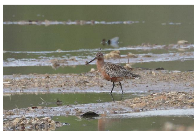
Bar-tailed Godwit: Moor Green Lake; 21Apr2023

(Disclaimer: The views expressed in articles in this Newsletter are those of their respective authors and may not be representative of those of the BOC or of any of its Committee.)