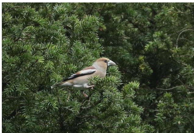
Hawfinch: Aldermaston; 24Feb2023