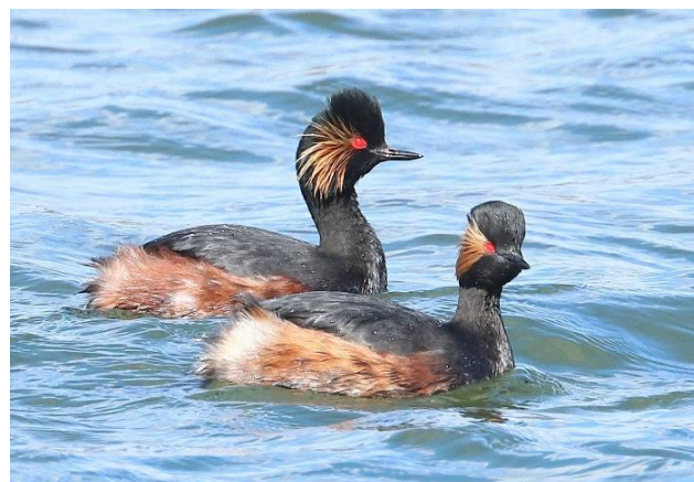
Black-necked Grebe: Lower Farm; 22Mar2023