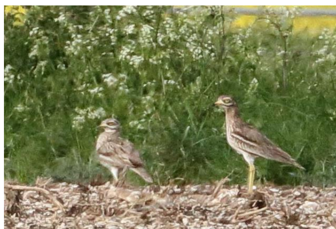
(Two photos: Berkshire Downs © Andy Tomczynski)

On our walk, we heard and saw the usual common downland birds such as Whitethroat, Linnet, Chaffinch, Skylark, Yellowhammer and Corn Bunting. Fly-over birds included Swift and Lesser Black-backed Gulls. The only raptors seen were Red Kite and Buzzard. At dusk we had really good views of two Barn Owls hunting, one settling on a post not far from us. Whilst scanning the fields from Roden Down we picked out a pair of Stonechats near Roden Farm, and two Grey Partridge in the same locality. Unfortunately, try as we could, we could not find any Stone Curlew but only heard them calling from the Oxfordshire side of the Ridgeway. However, one of our group, who had left us before dusk, heard and saw two Stone Curlews fly across the track in front of him very near to where we had parked the cars! That's life!