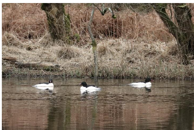
Goosander: Ufton Nervet; 3Mar2023