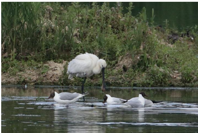
Spoonbill; Lea Farm Lake; 28June2021