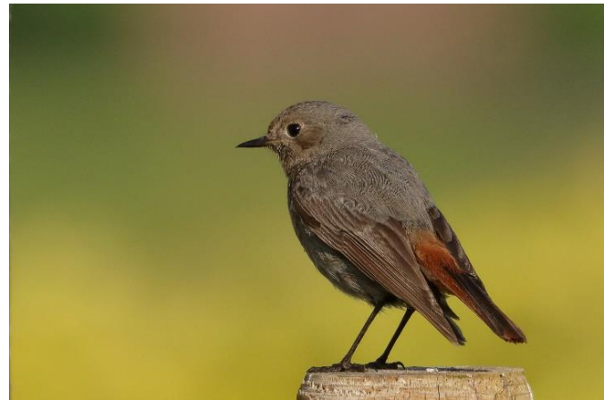
Black Redstart; Warfield; 5June2021