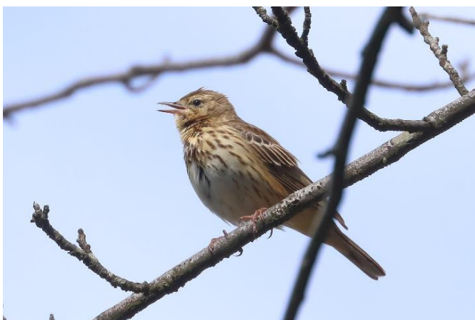
Tree Pipit; Swinley Forest; 27May2021