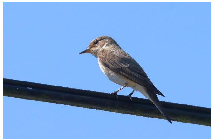
Spotted Flycatcher; Streatley; 23June2021