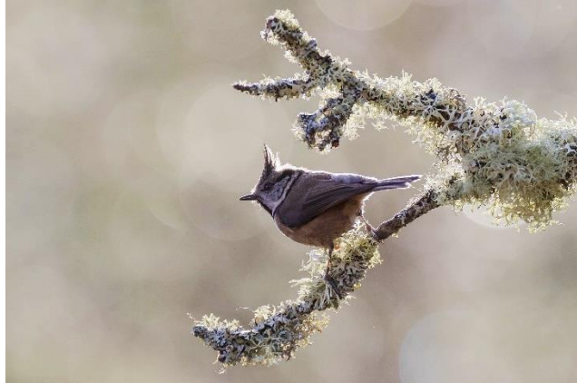
Crested Tit Brian Winter

(Ed: Apology for some slight cropping of these images.)