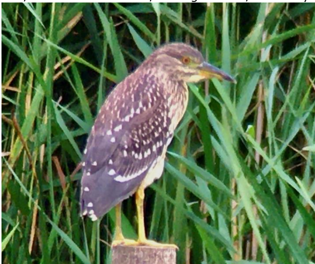
Aug/Night Heron/Sandford Lake/R Stansfield