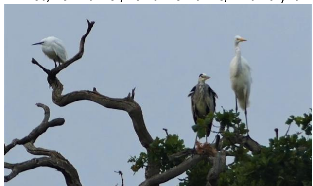
May/Great White Egret/WindsorGreatP/D Barker