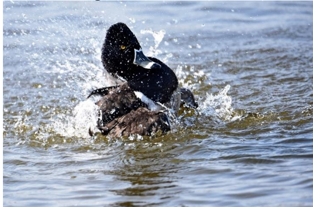
Ring-Necked Duck