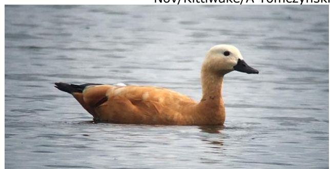
Jly/Ruddy Shelduck/Theale Main/R Stansfield