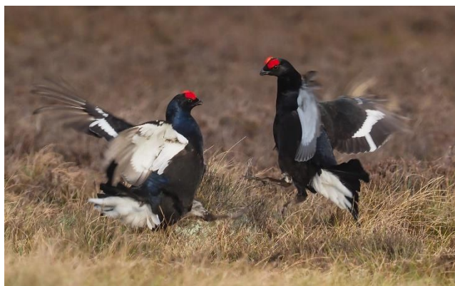
1st Black Grouse