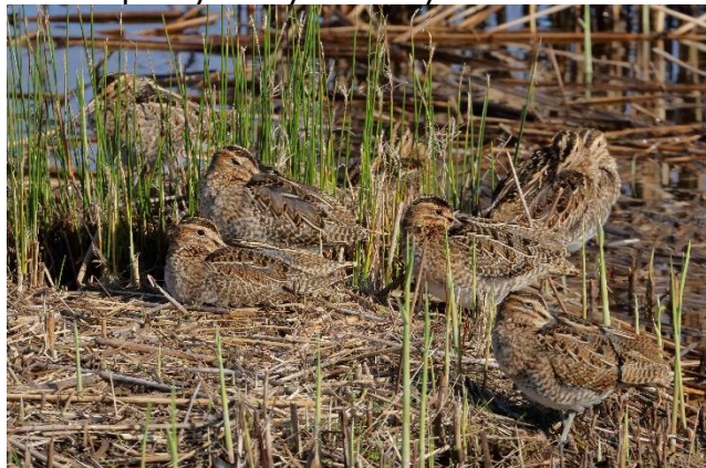
1st Snipe