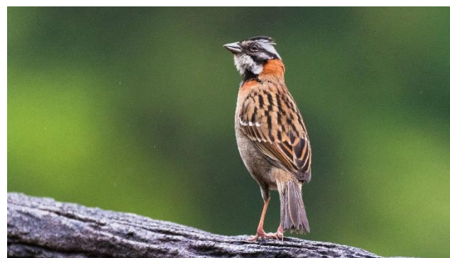
Rufous-Collared Sparrow Brian Winter