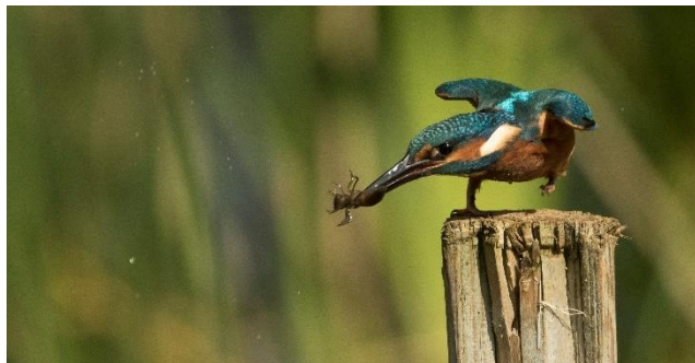
Eurasian Kingfisher