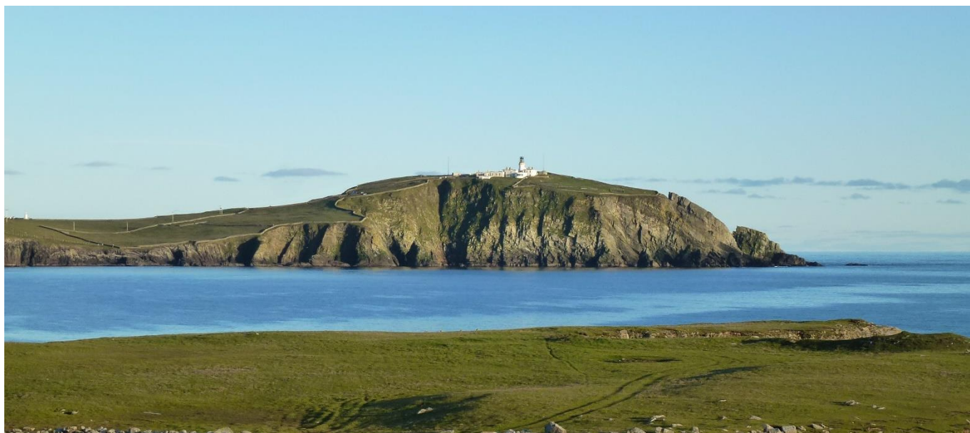
Sumbrugh Head with the lighthouse complex

Whereas the auks, shearwaters and petrels have long left their breeding sites, some special birds (for a Berkshire birder) remain into the autumn. These include Fulmar and Great Skua which cruise along cliff tops, Black Guillemots, Eiders and Red-breasted Mergansers in the bays and Twite around the crofts. Expected migrants include a good variety of waders, passerines such as Common Redstart, Wheatear and Spotted Flycatcher, while later in the autumn parties of Barnacle Geese can be seen approaching low over the sea and landing on some remote headland. These birds are all fairly obvious but to find some of the rarer species that the Shetland Islands is renowned for can require some persistence, patience and luck.