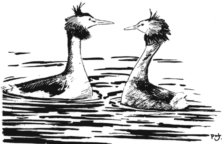
Great Crested Grebes, Phil Jones

* records do not include the report of a roadside corpse at Bury Down on Aug 16