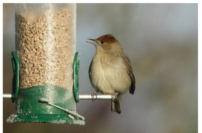
Blackcap: Reading, RG4; 16Dec2022