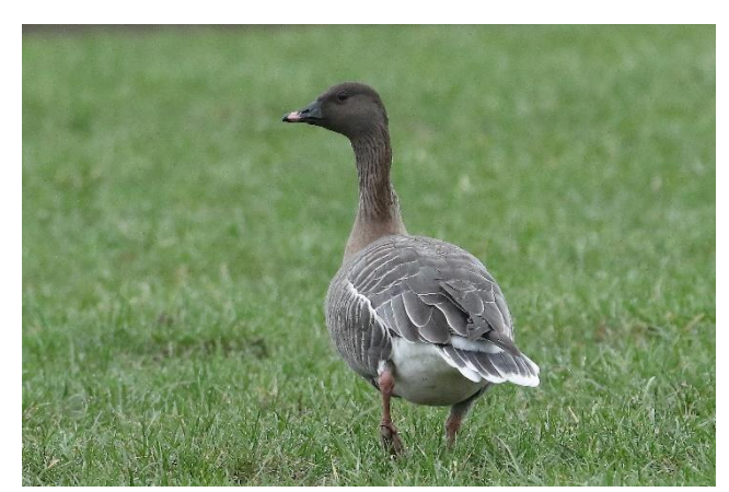
Pink Footed Goose: Home Farm; 4Feb2023

(Disclaimer: The views expressed in articles in this Newsletter are those of their respective authors and may not be representative of those of the BOC or of any of its Committee.)