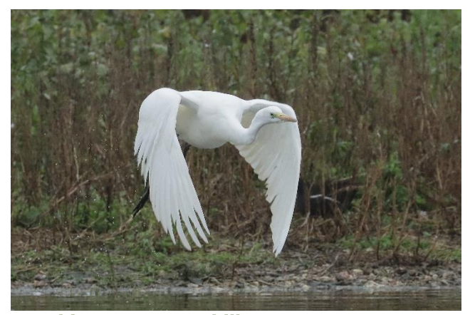
Gt White Egret: Hosehill LNR; 14Nov2022