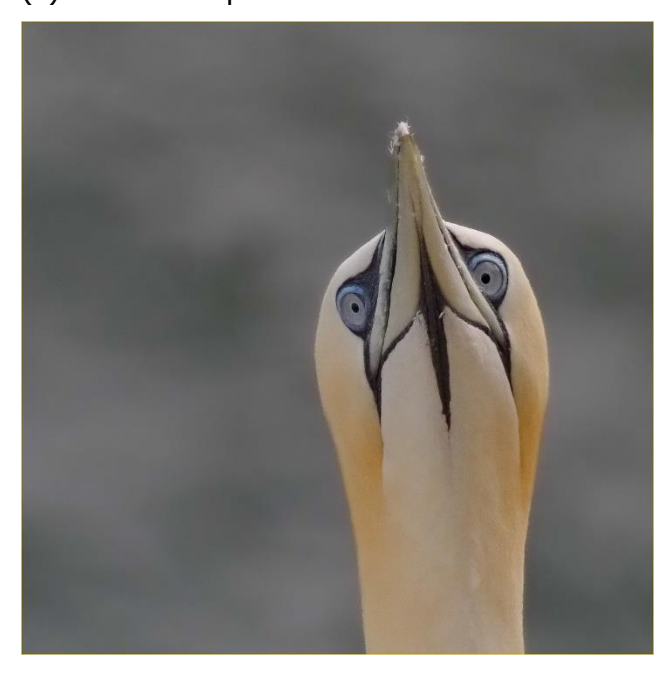
(2) Gannet – Sue Truby