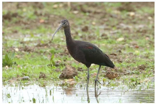
Glossy Ibis: Moor Green Lake; 270ct2022