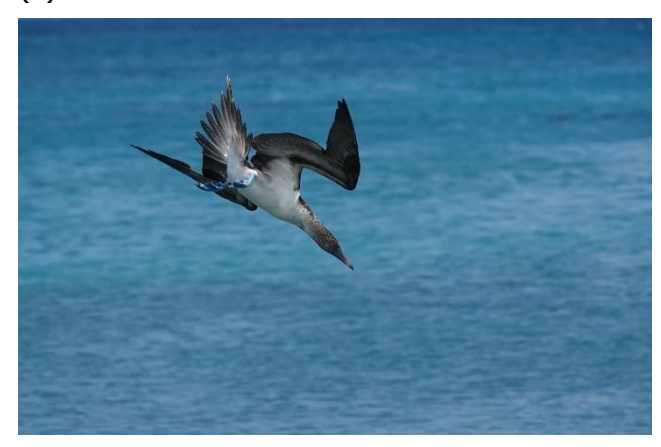
(4) Blue-footed Booby - Judith Clark