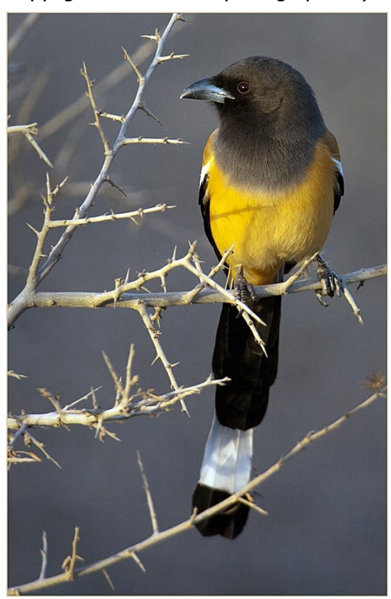
(1) Rufous Treepie