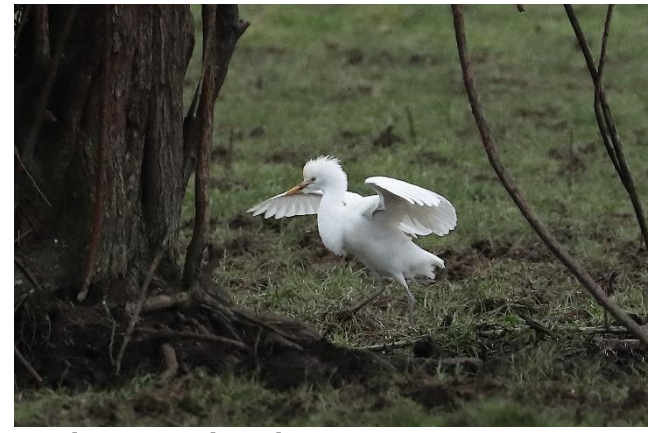
Cattle Egret: Chapel Green; 28Jan2023