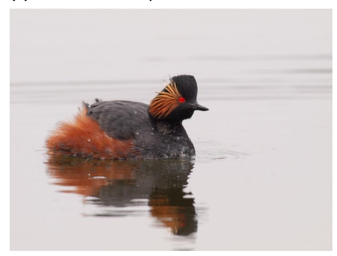
(5) Black-necked Grebe - Mike Smith