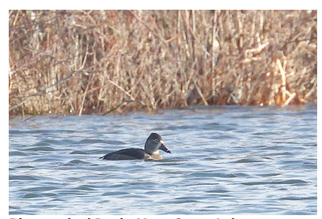
Ring-necked Duck: Moor Green Lake; 15Jan2023