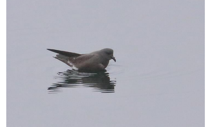
Leach's Petrel; Queen Mother Reservoir; 80ct2021

And finally, a message from your committee – have a pleasant Christmas and New Year.