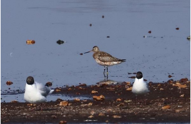
AT: Bar-tailed Godwit (April)