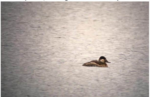
Ruddy Duck (Winter season)