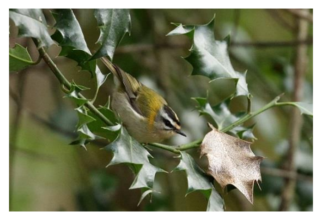
AT: Firecrest (February)