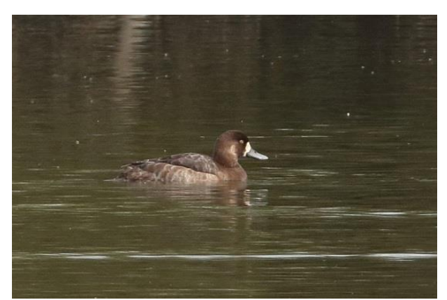
AT: Scaup (April)