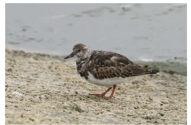
Turnstone; Queen Mother Reservoir; 14Sep2021 (one of six)