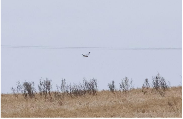
Hen Harrier; Compton Down; 30Aug2021 (present for several days)