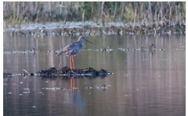
MW: Spotted Redshank (April)