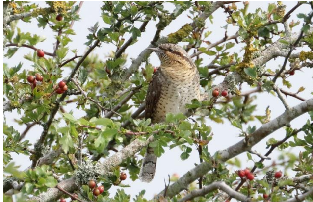
Wryneck: Greenham Common: 3Sep2021