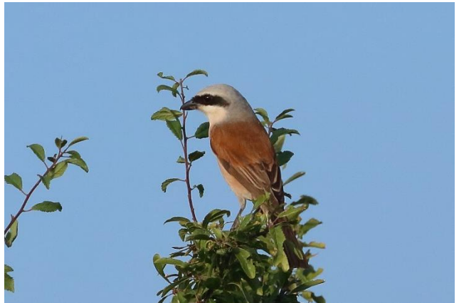
Red-backed Shrike; Eldridge Park, Wokingham; 5Sep2021