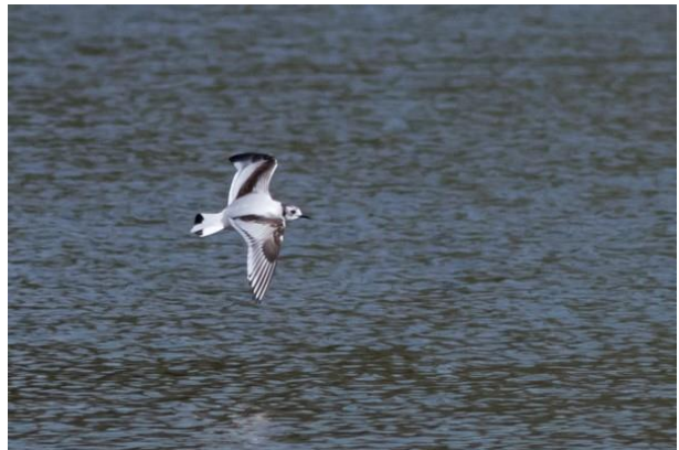
MW: Little Gull (April)

AT: Common Crossbill (March)