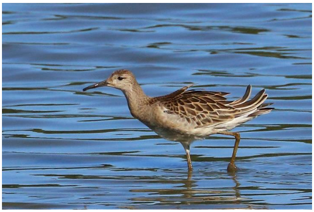
Ruff; Sulhamstead Abbots; 7Sep2021