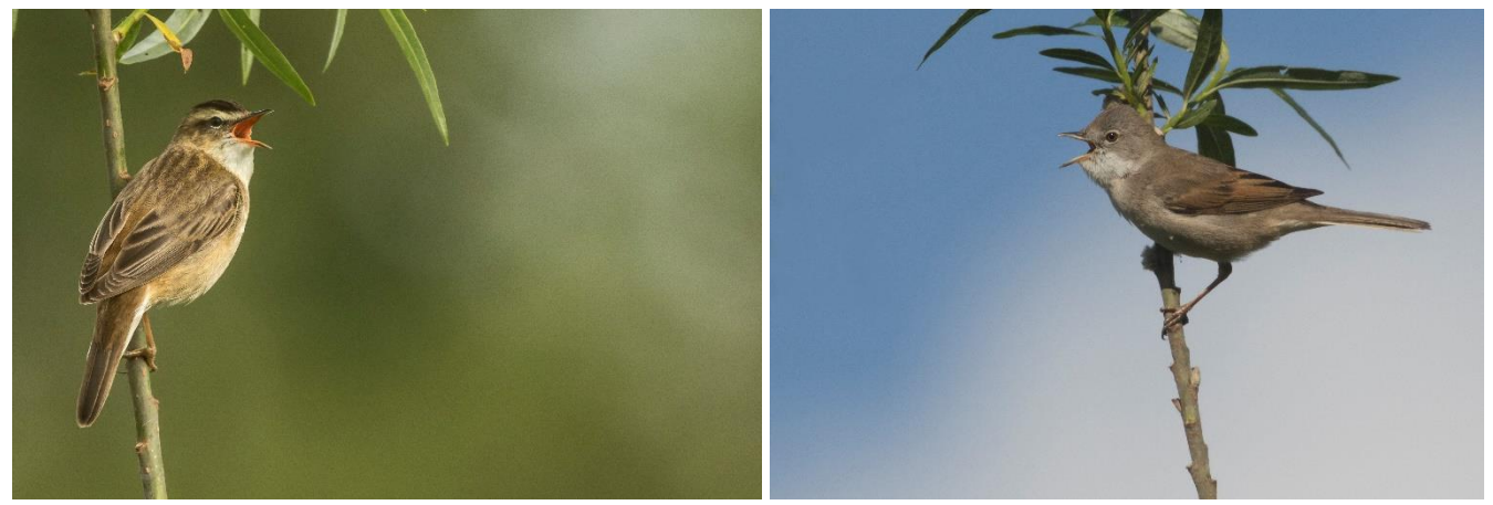
Sedge Warbler and Whitethroat at Fobney Island