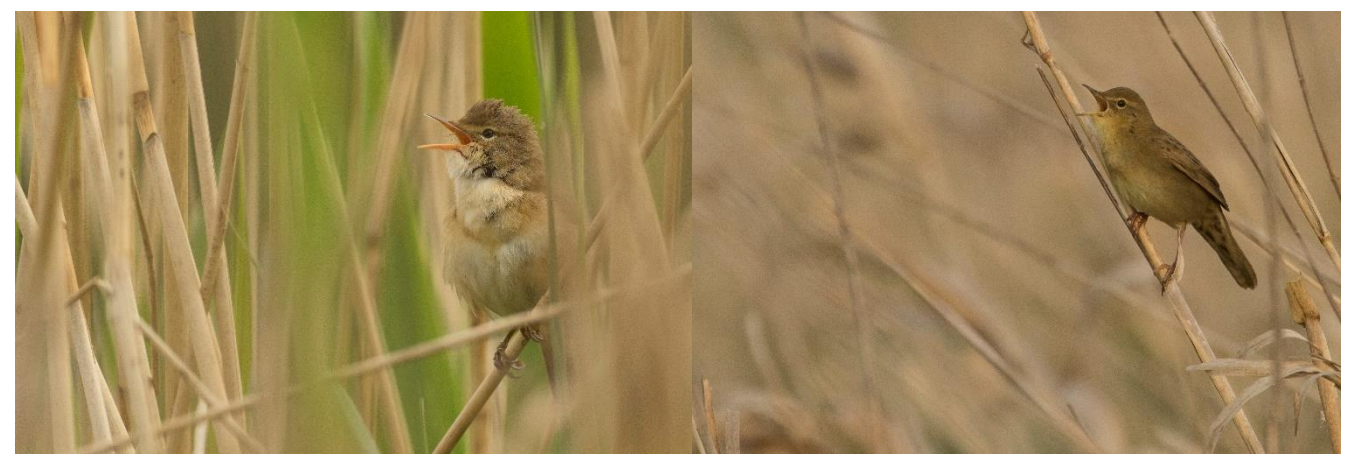
Reed Warbler at Dorney Wetland, Grasshopper Warbler at Southcote Meadow