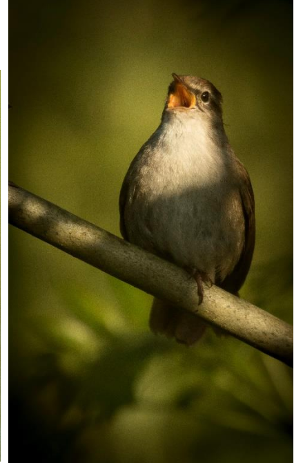
Common Tern at Dorney Wetland and Cetti's Warbler at Burghfield GPs