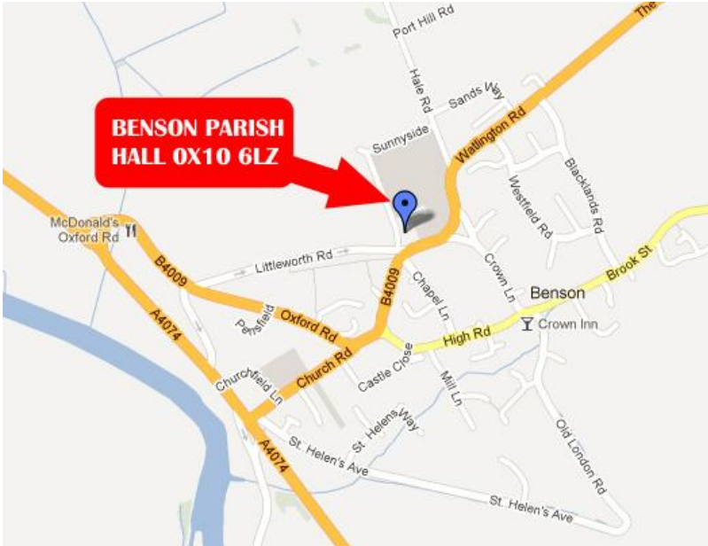
LOCATION OF BENSON PARISH HALL